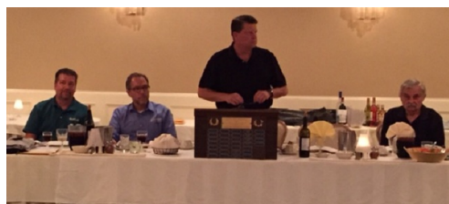
New Garden State Chapter Board of Directors

For more information on the Garden State Chapter, please visit www.gardenstate.thinkoesp.org .