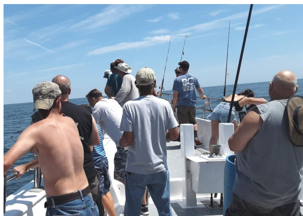
Group looking at the two whales that were close to the boat.