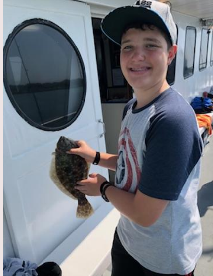
For more information about the Long Island Chapter, please visit <u>long-island.thinkoesp.org</u>.