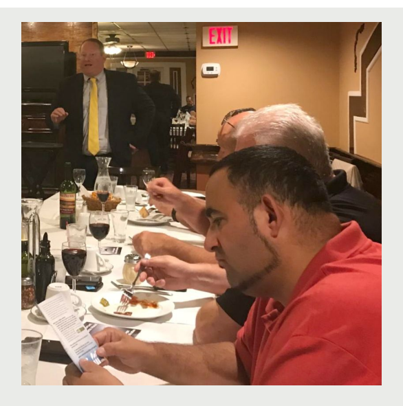
For more information about happenings in New Haven, please visit: newhaven.thinkoesp.org.