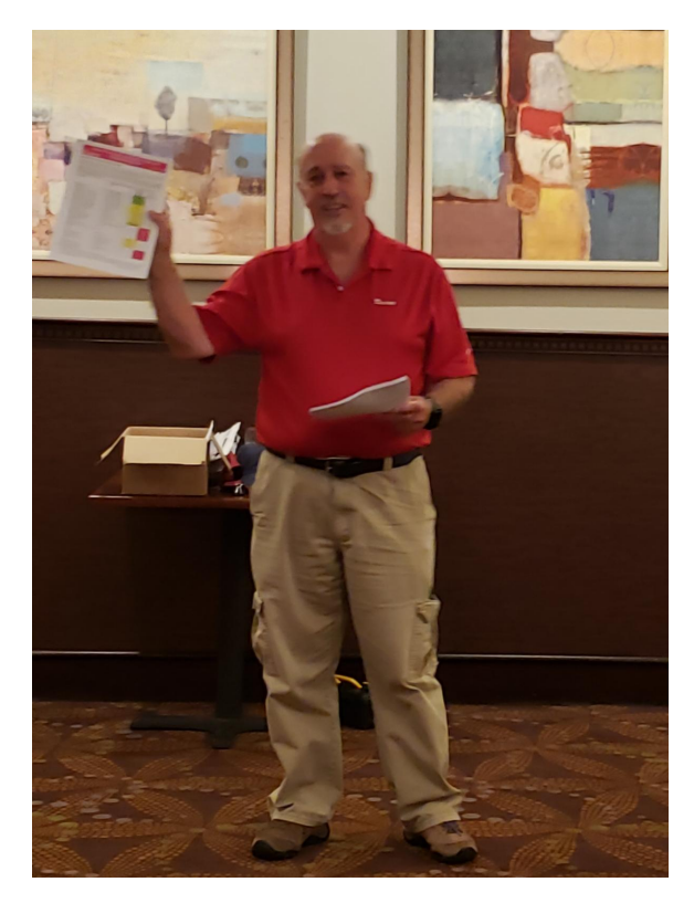
For more information on the Rhode Island chapter, please visit rhode-island.thinkoesp.org .