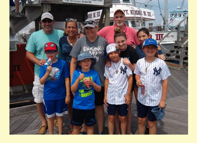
Click <u>HERE</u> to view more pictures.