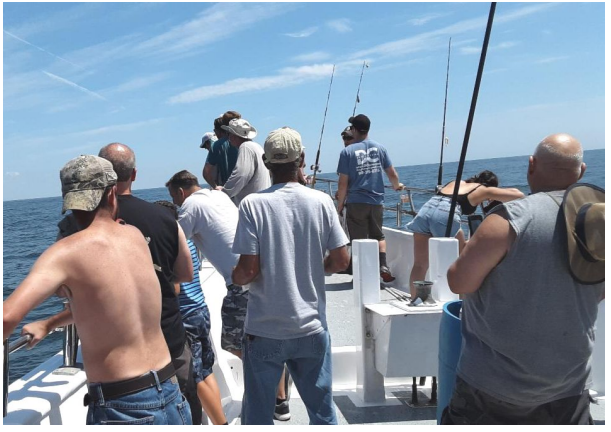
Group looking at the two whales that were close to the boat.